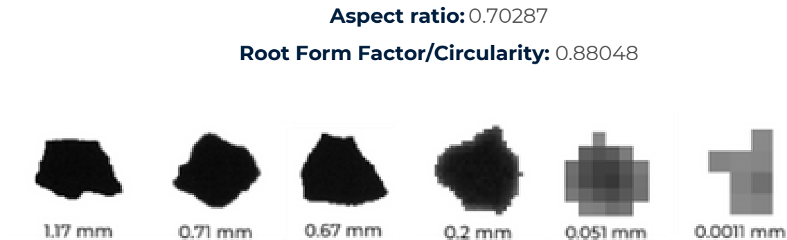
Figure 3: Particle Shape Example at Different Sizes

Particle geometry measured through Dynamic Image Analysis performed by a third-party entity with a CAMSIZER X2.