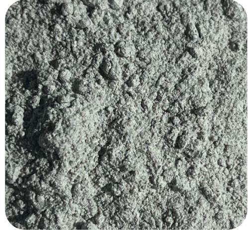
Figure 1: TLH-0 Close-up View